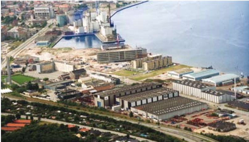
Aalborg Industries' corporate headquarters, heat exchanger business centre and factory in Denmark.

The annual number of marine boiler and thermal fluid heater units from the factory totals 300 while around 3,500 heat exchanger units and 400 oil/gas-fired burners are delivered.