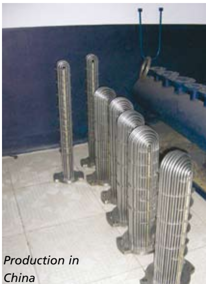
Production in China

VESTA™ MX oil preheater manufactured at the factory in China