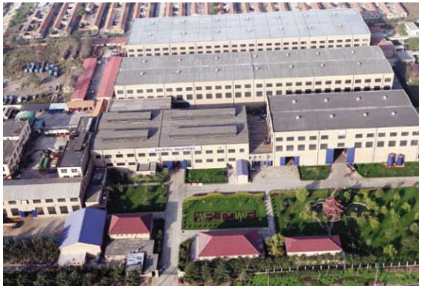
Aalborg Industries' marine boiler and heat exchanger factory in Jiaozhou near Qingdao, China.

Heat exchanger production in Jiaozhou near Qingdao was set up at the end of 2006 in new premises at the boiler factory. The production staff has undergone extensive training in processing of the various materials and in the welding methods involved in the comparatively thinner and sometimes different materials used for shell & tube heat exchangers as compared to the steam boilers which the factory has manufactured since being established in 1974. Aalborg Industries Ltd. is a private limited company