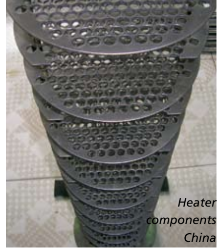
Heater components China

The VESTA™ brand name is derived from the Danish company A/S Vesta which was established in 1914 and was acquired by Aalborg Industries in 1993. A/S Vesta began manufacturing heat exchangers in the 1940s. According to Roman mythology, Vesta was the goddess of the hearth fire.